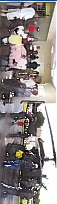
Sister City Scenic Flights Community Events