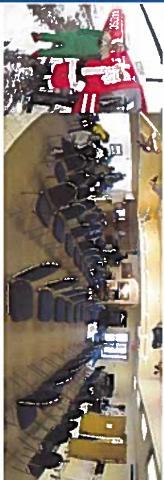
Breakfast with Santa Meeting Room/Kitchen/Board Room