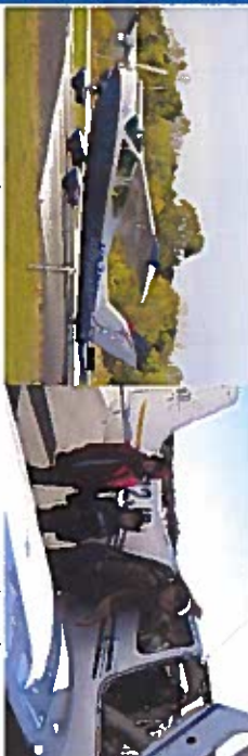
Spot Landing Contest Young Eagle Rides