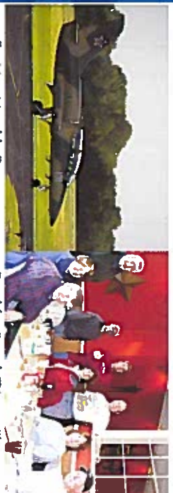
Exciting Monthly Programs Breakfast/Lunch/Dinner Fly-outs