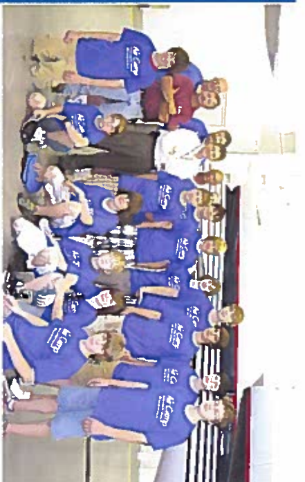
Aircamp for Kids touring Kohler's Flight Department in Sheboygan.