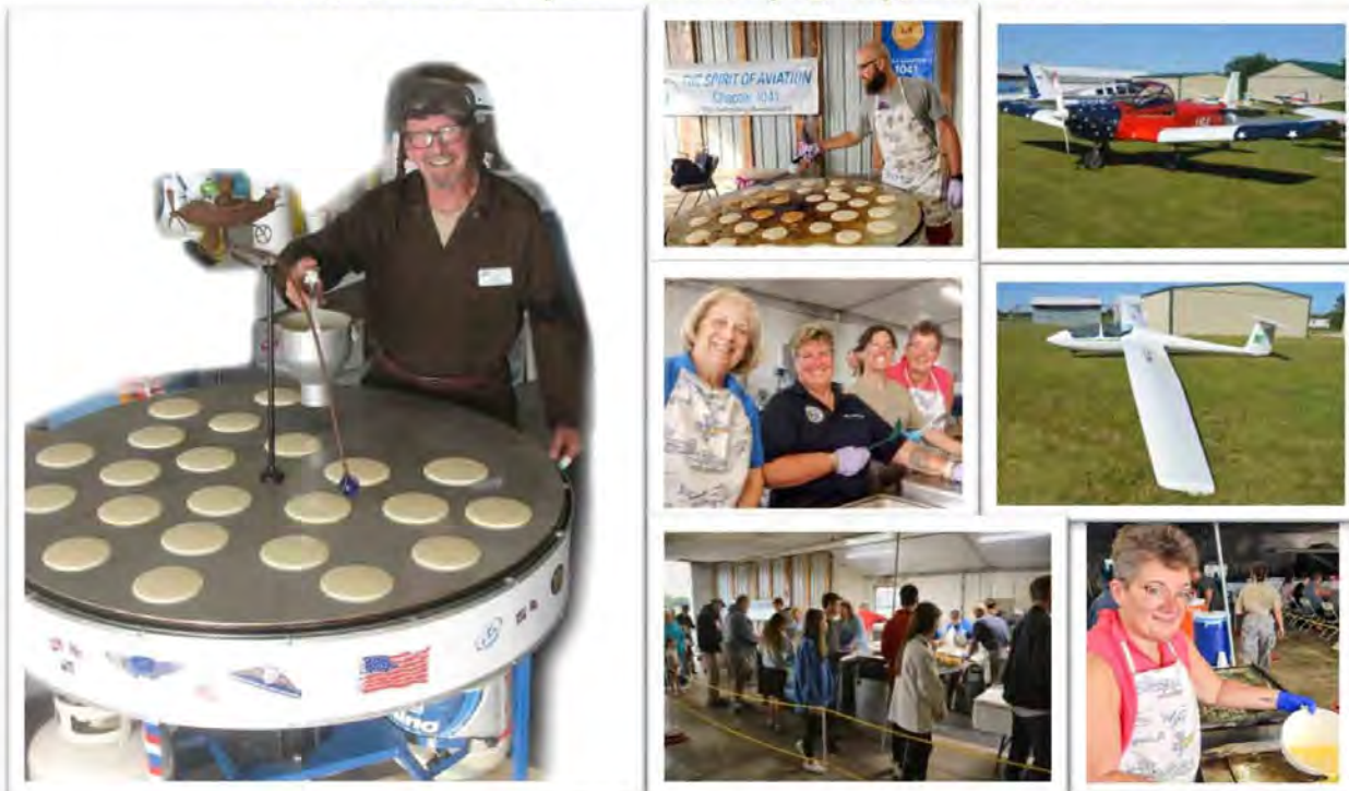
Above pictures from our last breakfast! On left, Floyd’s Fabulous Flying Flapjack Machine was constructed by Floyd Armstrong (1944–2014)

Also, come see “Floyd’s Fabulous Flying Flapjack Machine”!