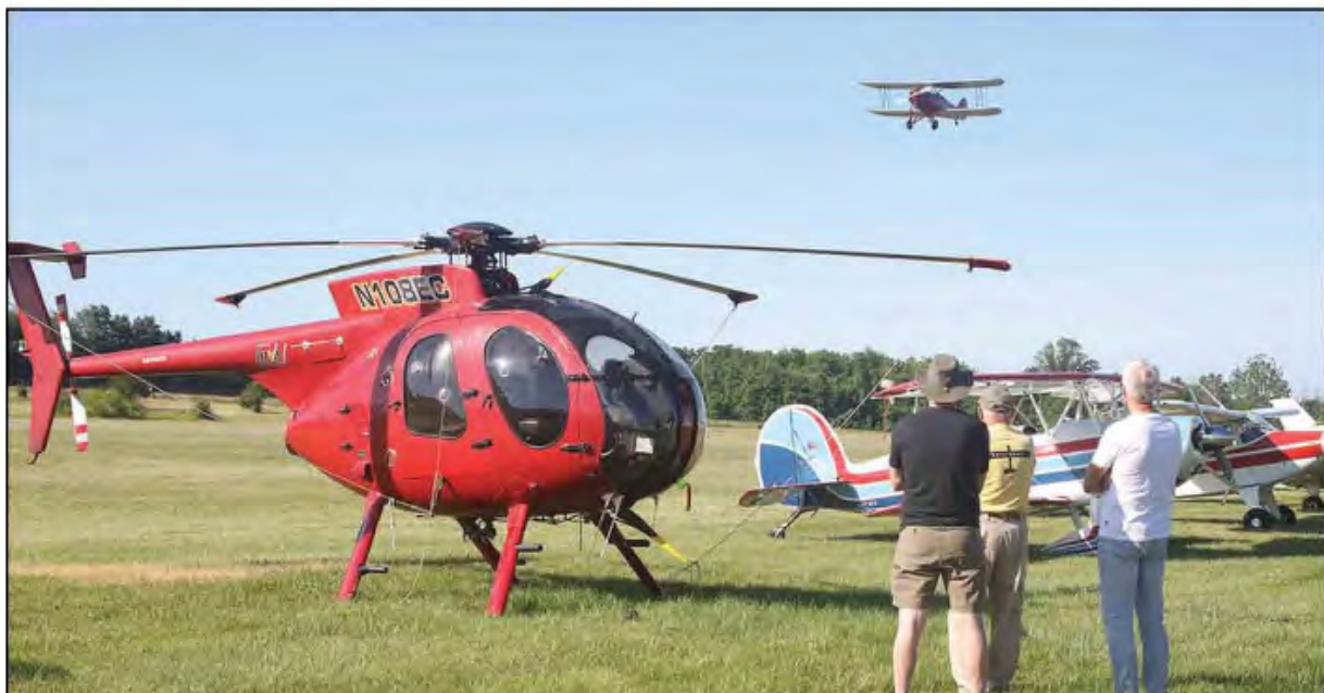
Below, a bi-plane takes off from the Gettysburg Regional Airport during the recent fly-in and pancake breakfast at the airport.