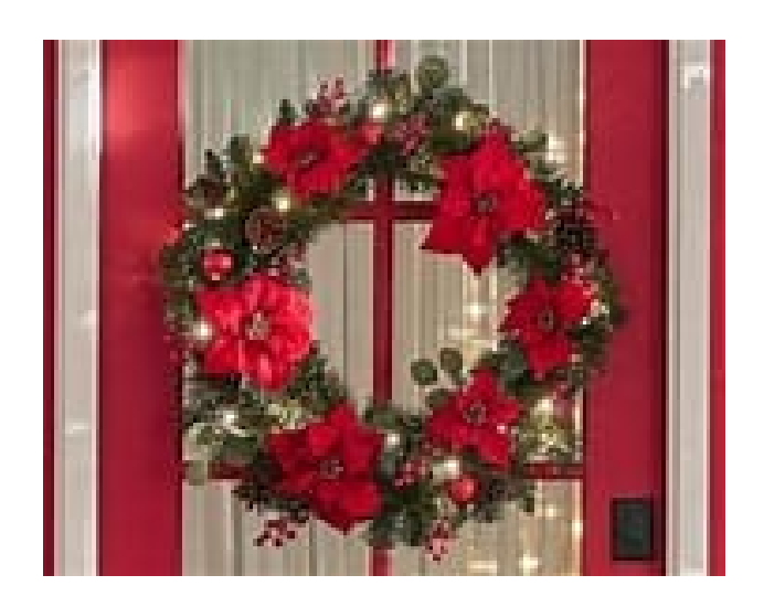
EAA Chapter 908 Christmas Party 2022

Our Christmas party and silent auction was another big hit. We had 36 members and guests that enjoyed the evening with great food and comradery. The silent auction was also well receive with $385.00 going to the Young Eagles fund.