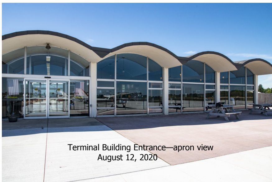
Terminal Building Entrance—apron view August 12, 2020