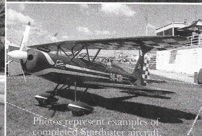
Photos represent examples of completed Starduster aircraft.