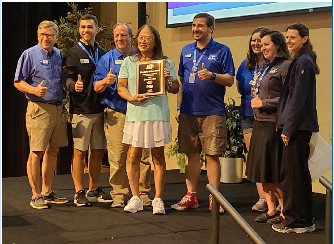
Below: The EAA Chapter Staff that presented me with the award.

We're on the Web! www.1041.eeachapter.org