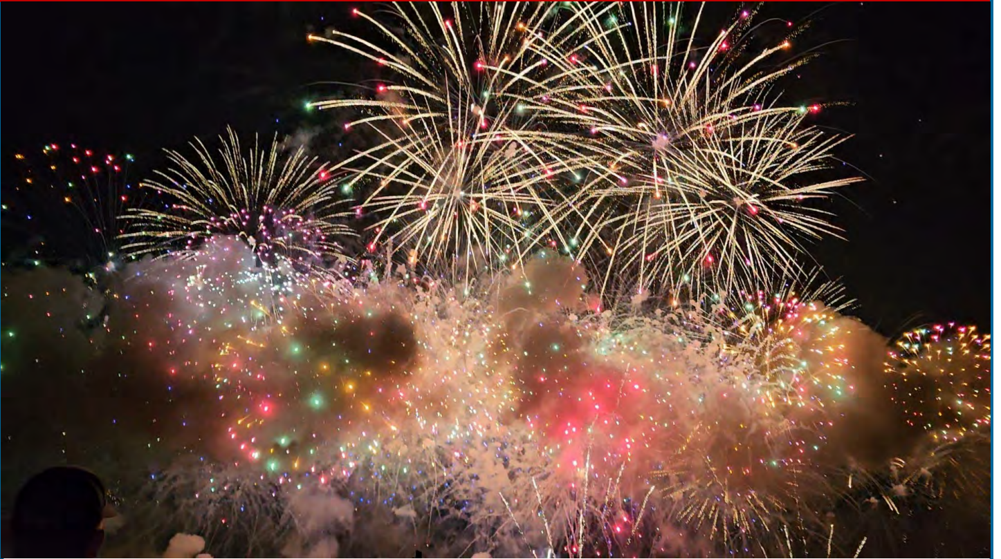
Above and below: Photos of the firework finale.