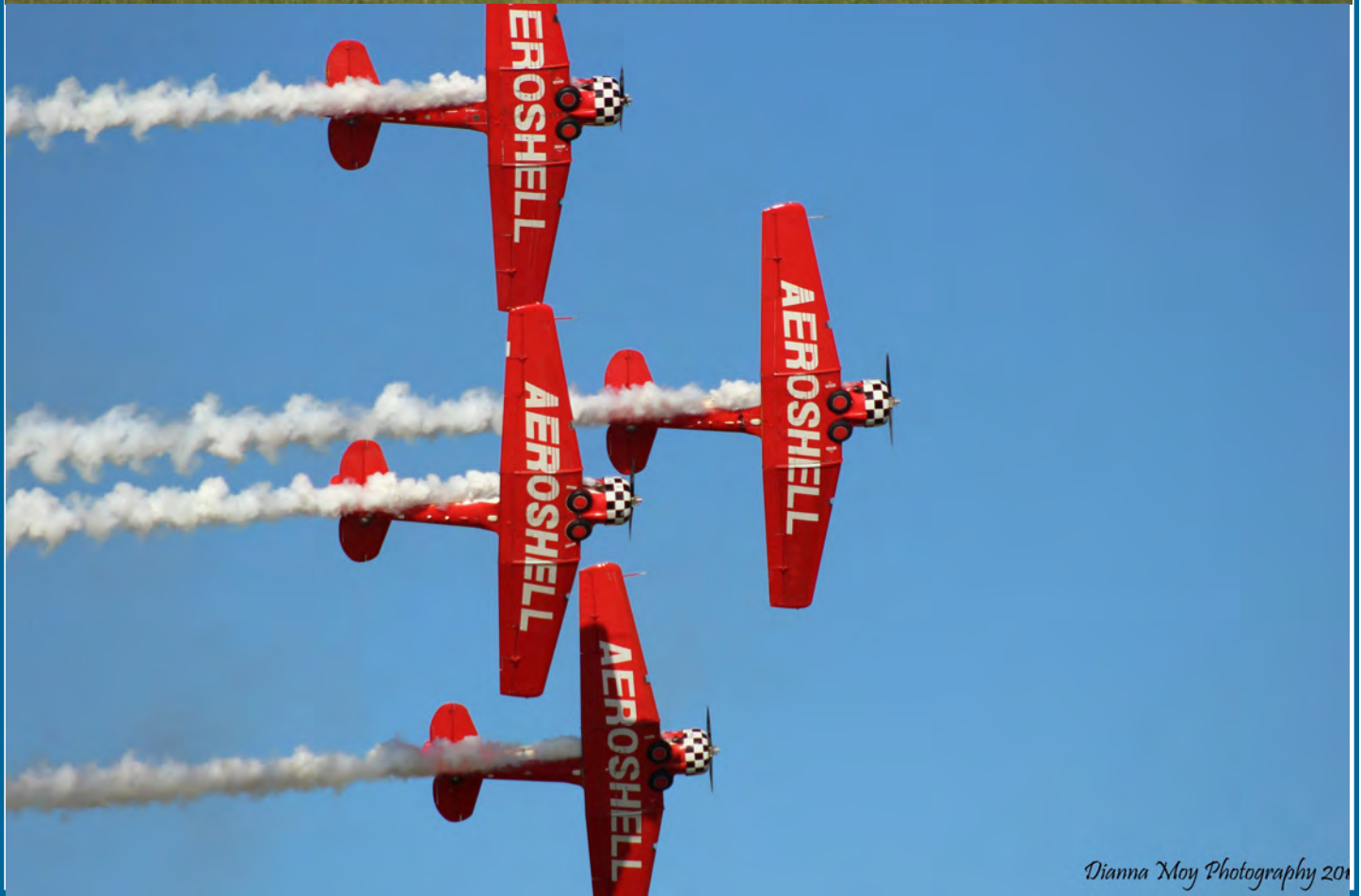
Dianna Moy Photography 2016