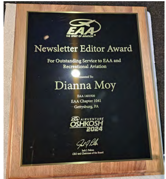
Above: The EAA Newsletter Award presented to me and Chapter 1041.