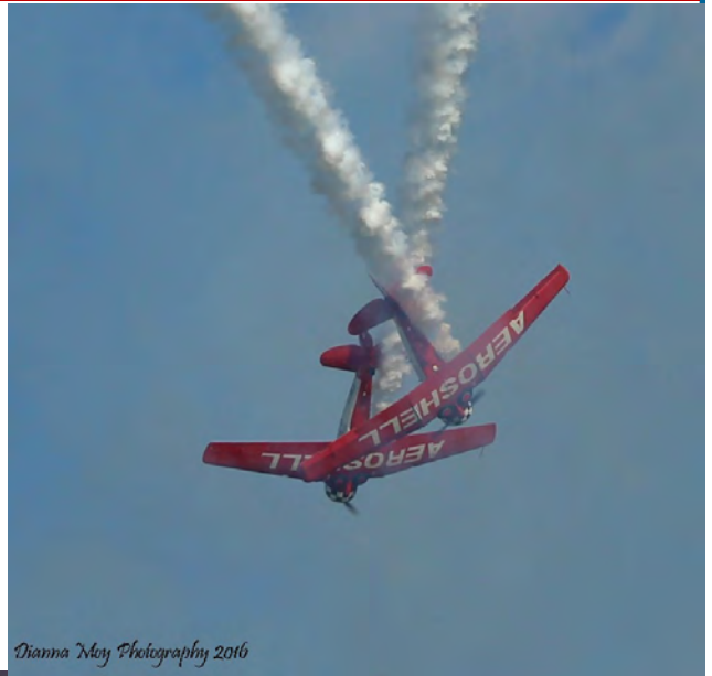
Dianna Moy Photography 2016

Page 17 wraps it up with photos of the massive 20-plane WarBird fly-over at the top, and the lead planes in a close-up in the bottom photo. All of these were from AirVenture 2016.