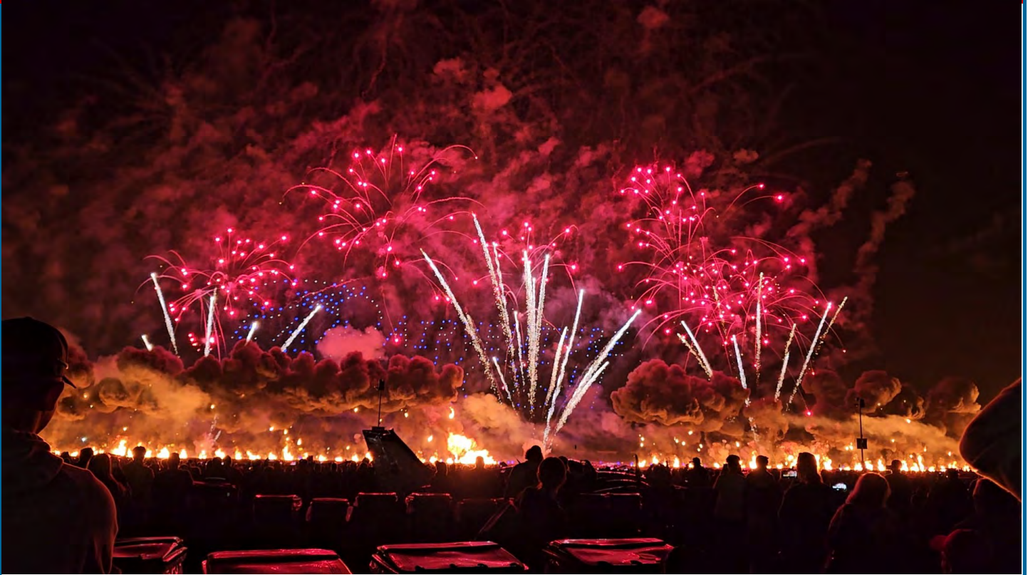
Above: The start of the airshow with the drones with the EAA AirVenture Oshkosh in blue behind the red and white fireworks. Below: The “wall of fire” that marks the beginning of the finale of the fireworks. You can actually feel the heat from that explosion.