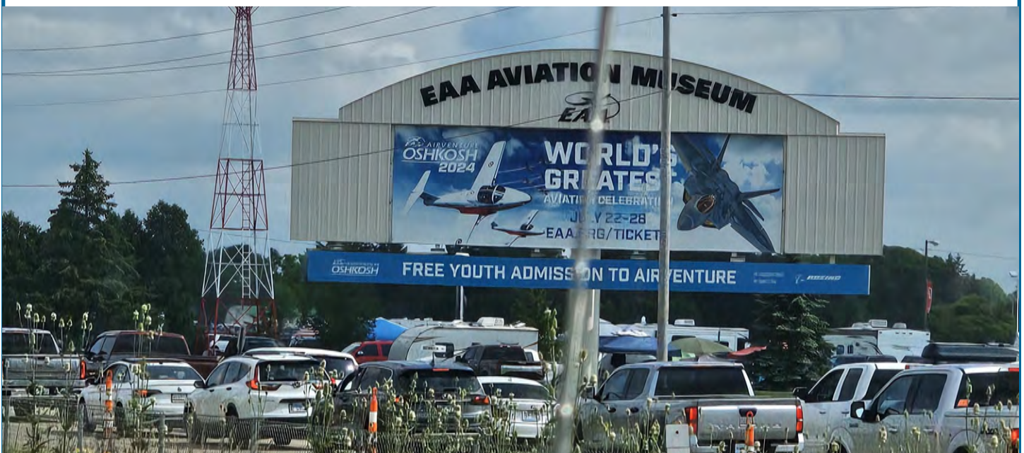
Photo below by D. Moy of the crowds entering the grounds at AirVenture 2024

THE EAA THANKS OUR MEMBERS THAT ATTENDED FOR HELPING MAKE THIS EVENT A SUCCESS