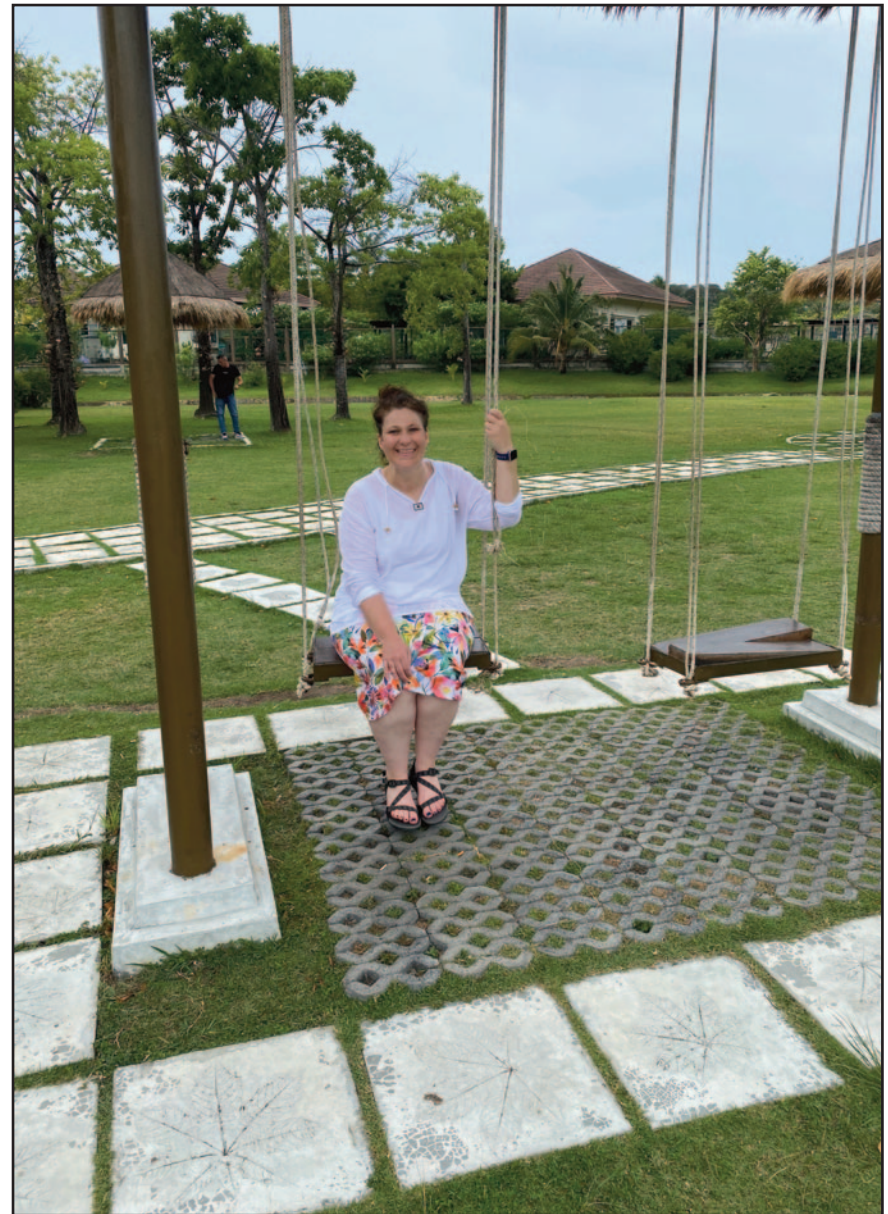
Airport terminal view