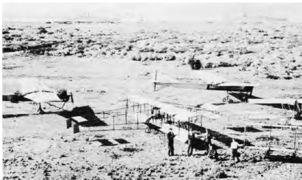
Below: Curtiss Flying School at North Island, San Diego, California in 1911