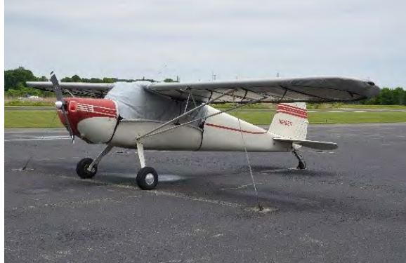
EAA Vintage Chapter 45 is looking for you!