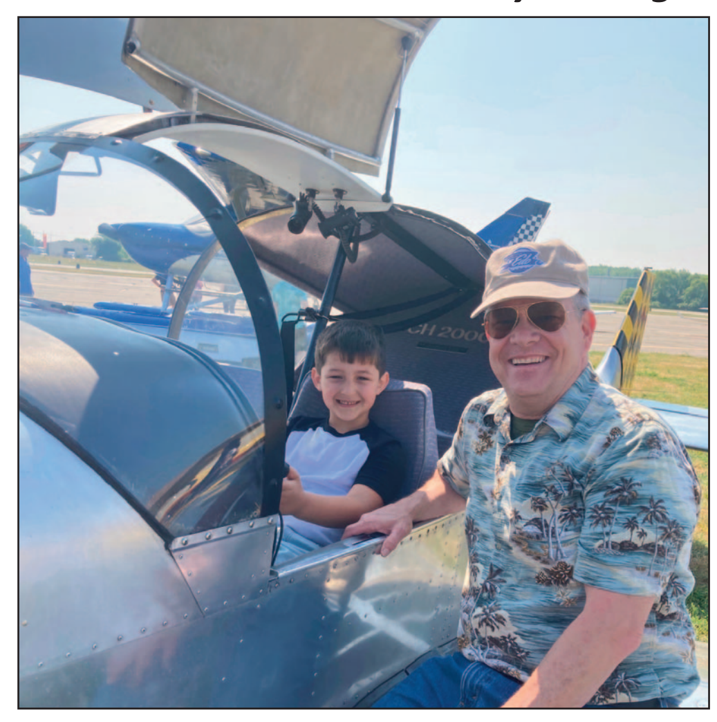
Happy faces at Chapter 113's Annual Father's Day Pancake Breakfast.