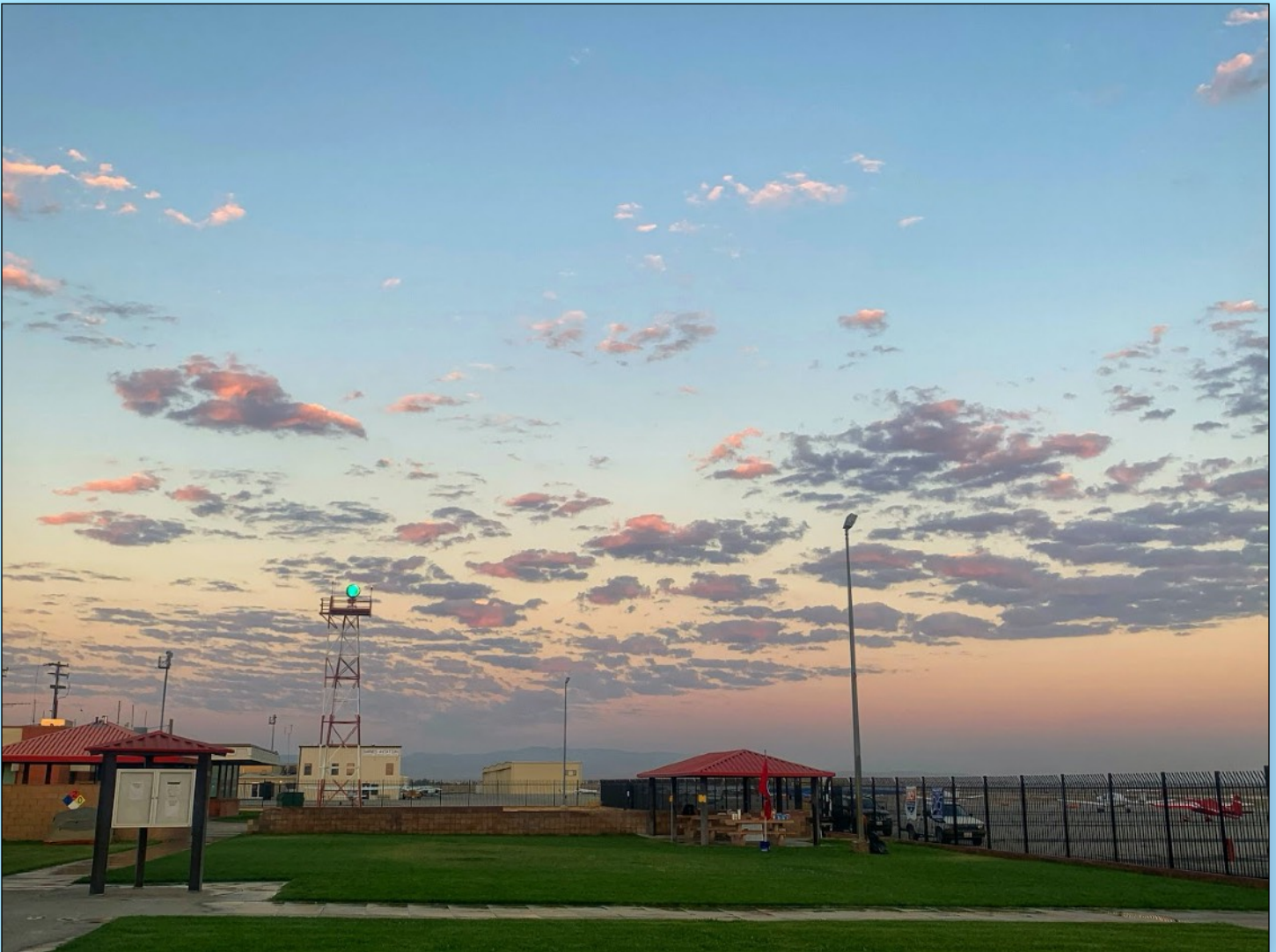
Sunrise after briefing