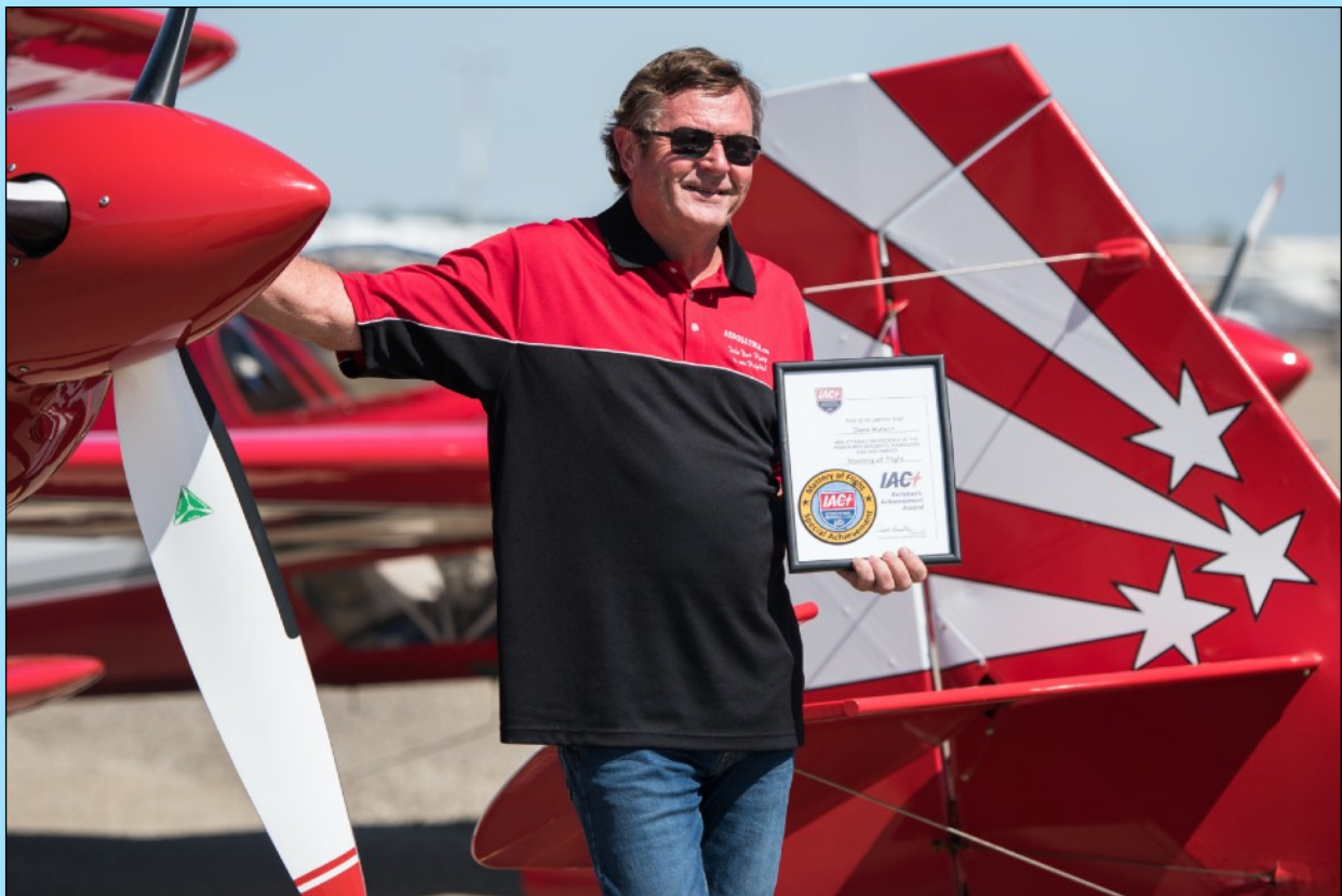
Dave Mastery of Flight Award

Very importantly, these criteria were established such that NO Unlimited experience is required to qualify and that the cross-over experience (glider vs. power and vice-a-versa) can likely be done in a rental aircraft. These two aspects we feel make this award more achievable than the All Ten Award which requires both Unlimited Stars and Smooth Awards.