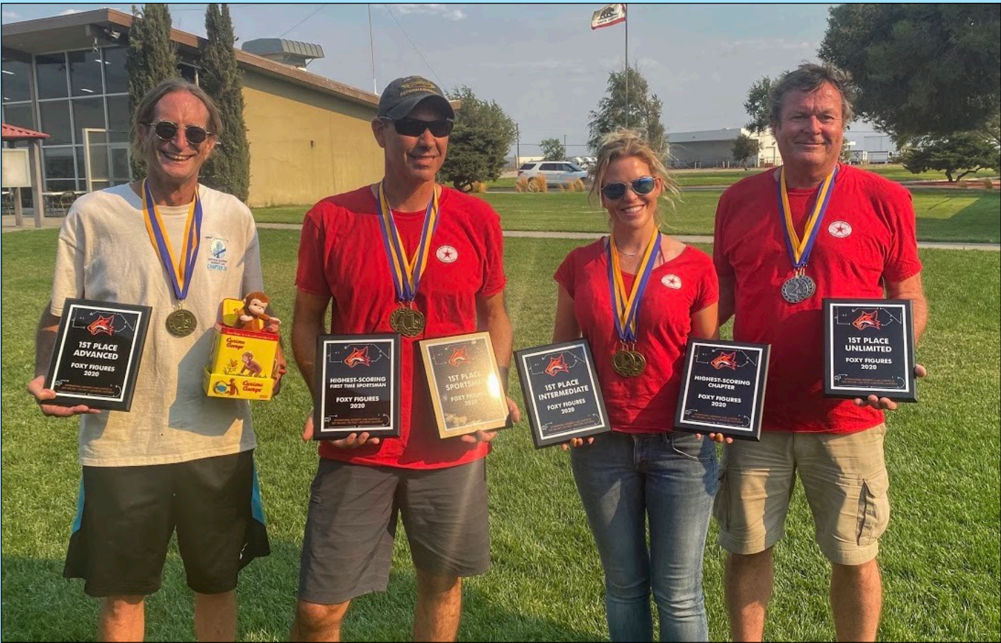
Chapter 38 all win first place