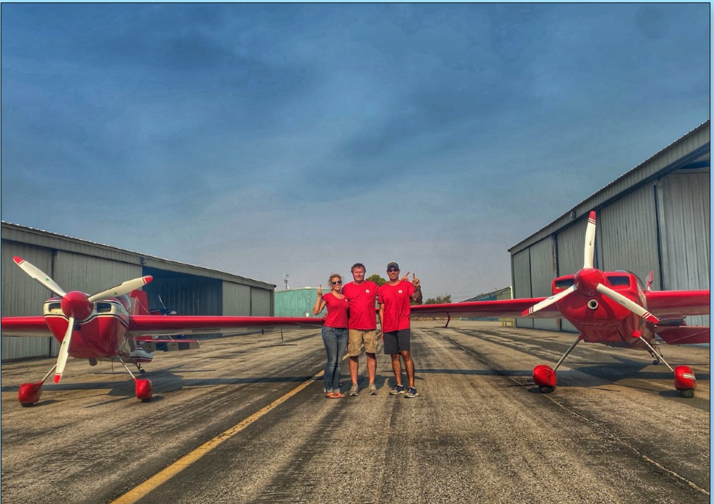
The Evil Empire is number one

All 12 pilots flew their Known flight on Saturday and only Unlimited and Sportsman flew their Freestyles. Sunday morning was kicked off with the Intermediate and Primary Unknown, followed by an order of flight change up with the Advanced, Unlimited and Sportsman Unknown and then the Advanced Free all in the same flight. Kudos to the Advanced pilots for surviving that.