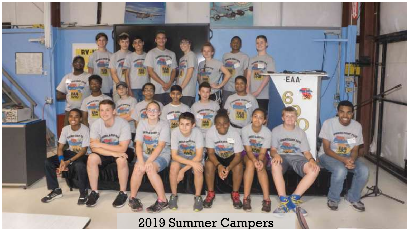
2019 Summer Campers