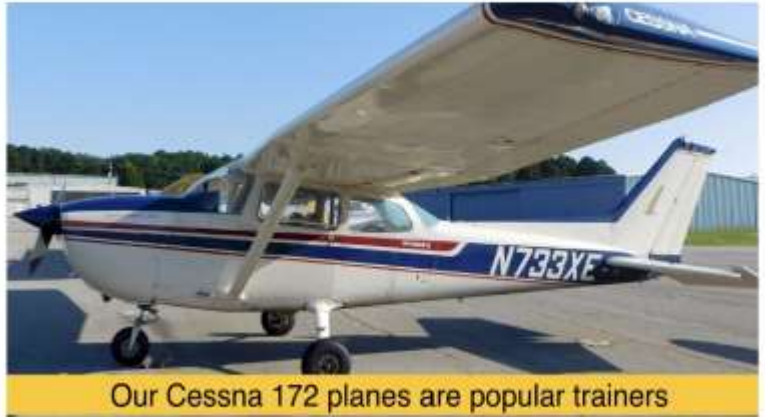
Our Cessna 172 planes are popular trainers

Founded in 2012 at Gwinnett County airport (LZU), the club now has over 60 members of all ages and backgrounds — from student pilots to certified flight instructors — to those who simply enjoy flying.