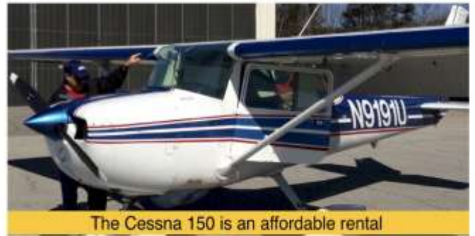
The Cessna 150 is an affordable rental

For more information on AeroVentures Club membership: