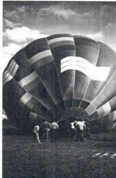
Balloon day at EAA690 January Flying Start

NEWS AND INFORMATION FOR THE GWINNETT COUNTY CHAPTER OF THE EXPERIMENTAL AIRCRAFT ASSOCIATION