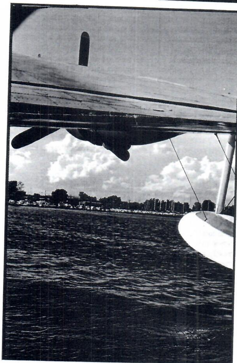
Richard took this beautiful shot from the rescue door of the Sunderland Flying Boat (aka Flying Porcupine). Lake Winnebago and the Fox River were up to their banks. Gorgeous skies prevailed almost everyday at Oshkosh.