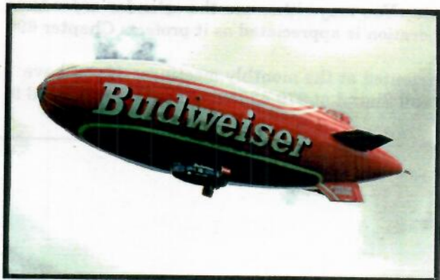
The Budweiser blimp's maneuverability in strong winds was amazing.

August Meeting is the Picnic at the Kuntz Home— Starts at 3:00 PM, eat around 4:30-5:00 PM.