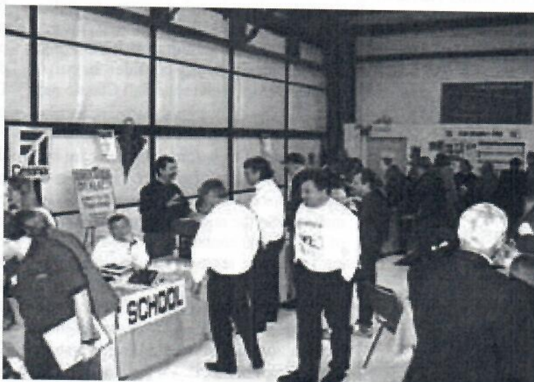
Picture of 1997 Flying Start Seminar Don't miss Flying Start 98 Saturday November 7

NEWS AND INFORMATION FOR THE GWINNETT COUNTY CHAPTER OF THE EXPERIMENTAL AIRCRAFT ASSOCIATION