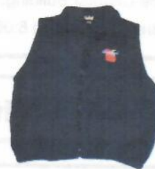
Fleece Vests $40.00