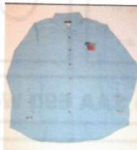
L/S Denim Shirts $35.00