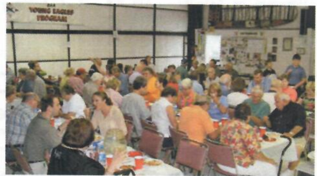
As usual, the large crowd enjoyed the varied and delicious food at the annual Chapter 690 Post Oshkosh Bash.