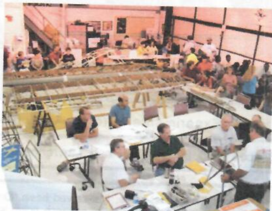
BUSY DAY - The Chapter Hangar hosted The Fabric Piper Cub Restoration Seminar and the monthly Young Eagle Rally.