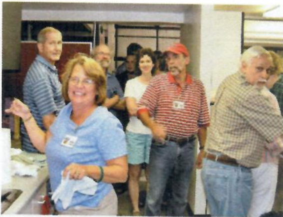
The hungry hordes lined up in the kitchen to get some of the fabulous food at the Bash.