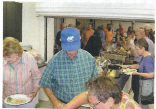
The long food service line passed by the many different and delicious dishes prepared by members.