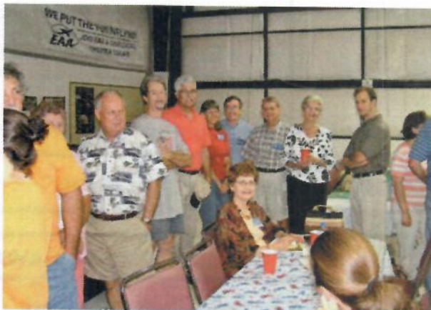
The Bash attendees waited patiently for their turn at the food service tables, enjoying the camaraderie of the others in the line.