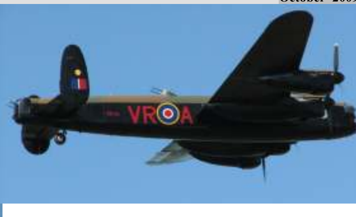
Photos 2 Harvards and photo 3 the Avro Lancaster performing at the Vintage Wings Airshow in September,