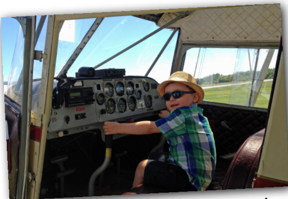
Future Young Eagle in the Fleet Canuck