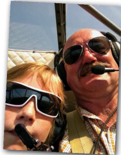
Selfie with a Young Eagle in the Canuck

Here are some general interest pictures of activities around Carp.