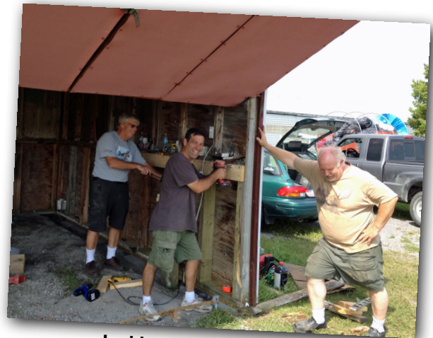
Jacking up and Levelling the Canuck hangar at CYRP