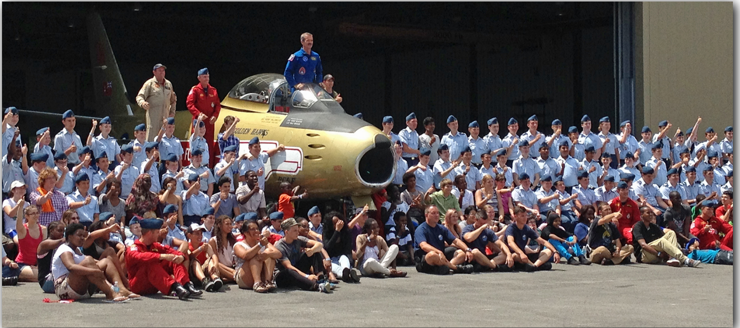
Air Cadets and Boy –Girls club members with Commander Hadfield in front of F-86 “Hawk One”. Snowbird pilots are in red.