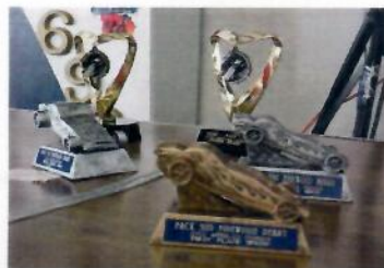
Some of the Trophies for the Winning Participants