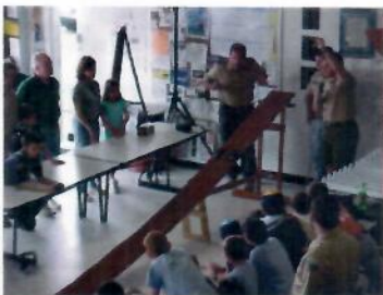
The Action at the Start Line