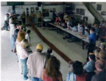
The Crowd Watches Intently - Almost No One Could Stay in Their Seat