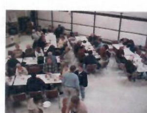
The tables begin to fill with the 70+ attendees who enjoyed the chili, side dishes & desserts.