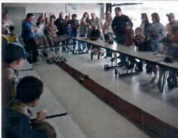
Another Close Heat Adds to the Morning's Excitement