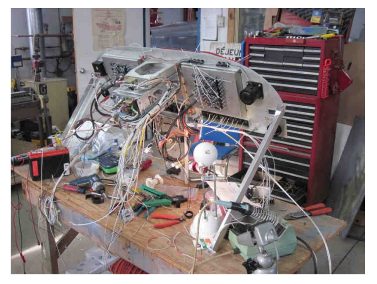
OK...what do I do now?

March 2010 I had the wings, tail and all flying surfaces finished, rigged and painted and work had started on the fuselage and engine installation.