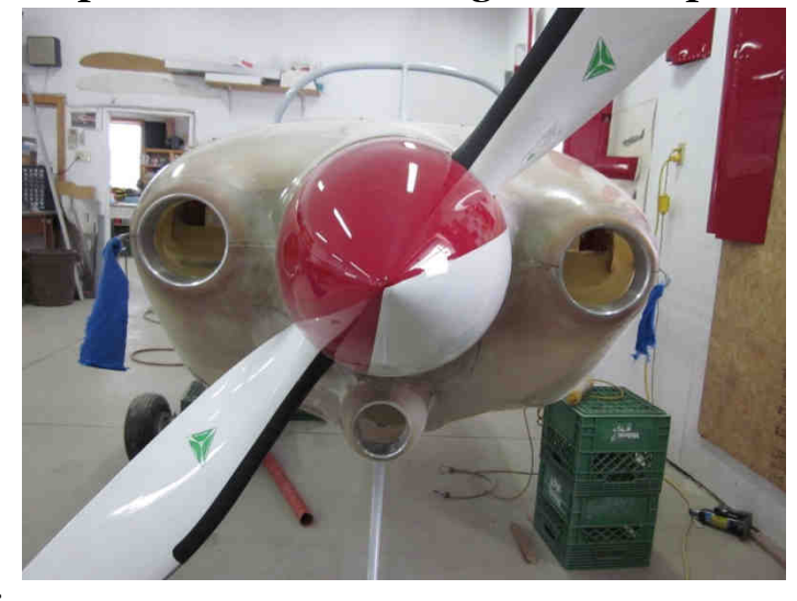
Business end of C-GGXY

The canopy is now completed. It was by far the most demanding installation of the aircraft, second only to the James cowl. Some may wonder at the paint scheme on