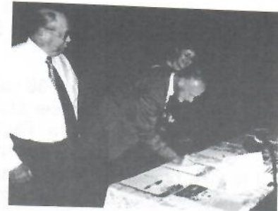
Dance attendees visit the Silent Auction Table. ⇐