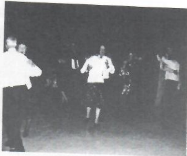
⇐ Dancers enjoy the music of The Atlanta Blue Notes.