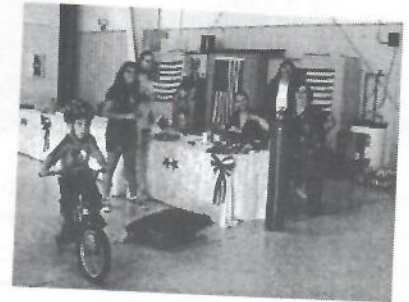
↑ The decorators are ready to go home and get ready for the big event.