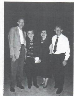
The Wilcoxes and Huffs at the end of a wonderful evening. ↓