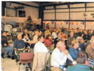
↑ An Attentive Audience