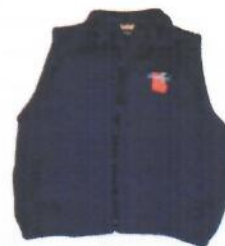
Fleece Vests $40.00