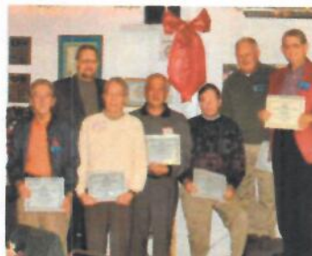
↑ New Standard Volunteers