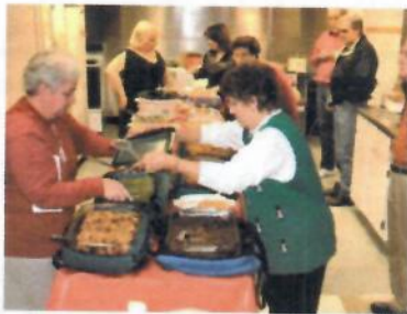
← Setting out the Food