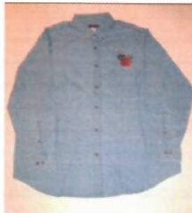
L/S Denim Shirts $35.00