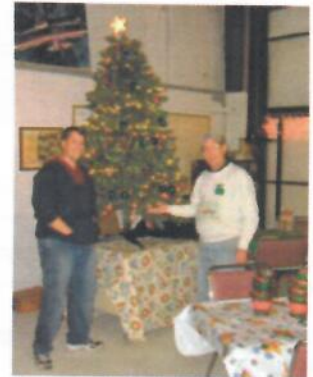
↑ Trimming the Tree