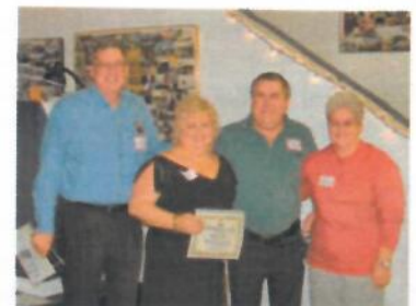
↑ Pancake Breakfast Crew Leaders