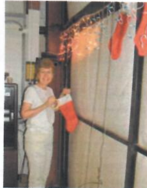
↑ Hanging the Stockings