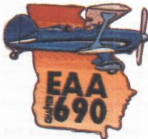
Logo Patches $6.00