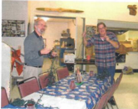
↑ Untangling the Lights