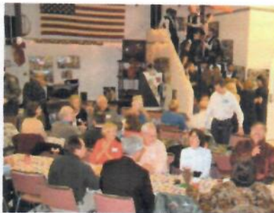
← The Attendees Gather