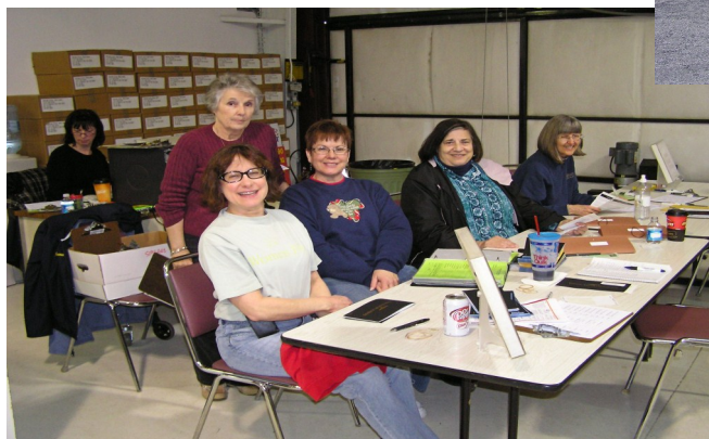
Picture to the left shows that these ladies are ready to get things started because nothing moves without the Paperwork and they handle it better than anyone.