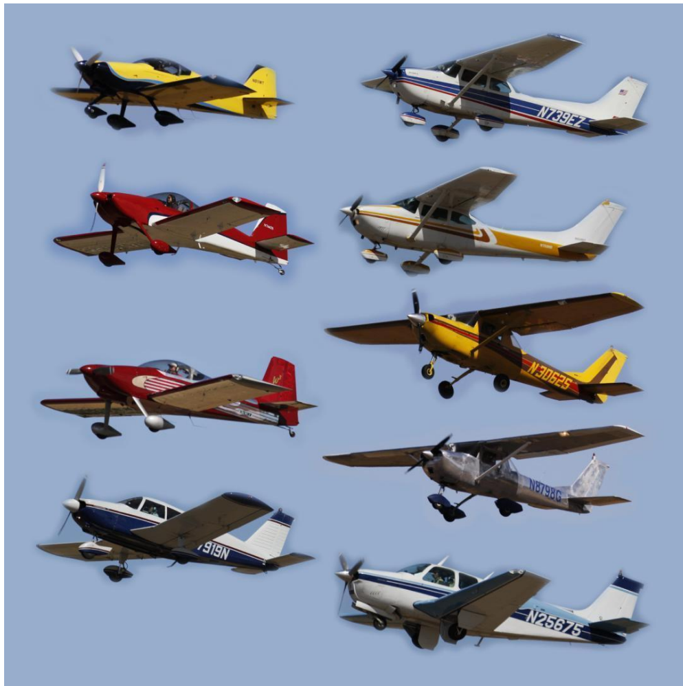
3. The Plane Collage! These are the planes that flew the rally.