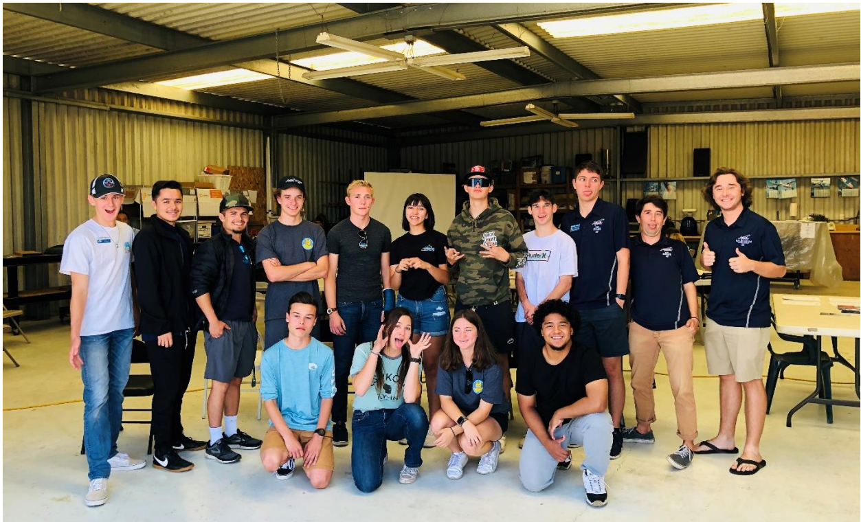
13. Past, present, pretend, and poser Ray Scholars...