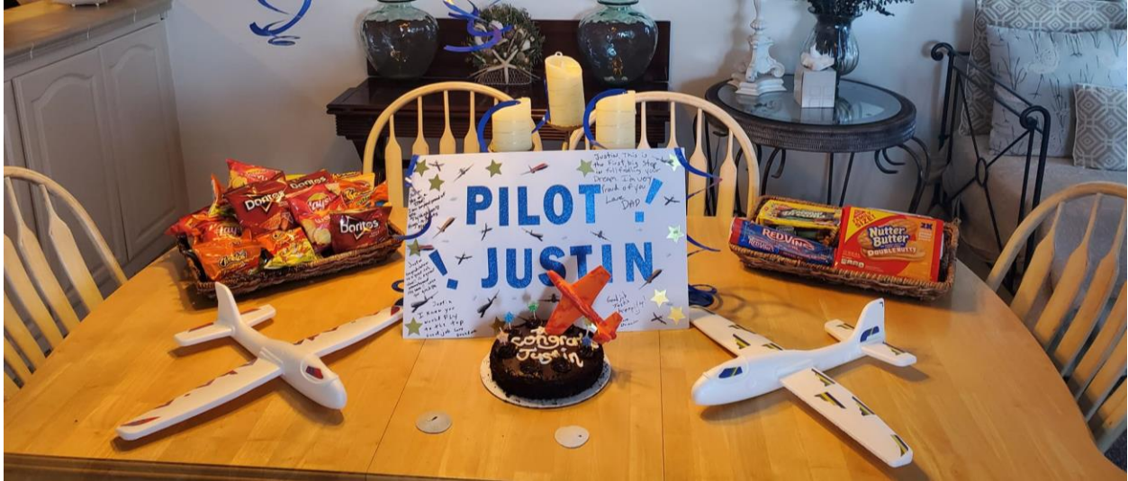
1. Justin's celebration sign and cake at home!