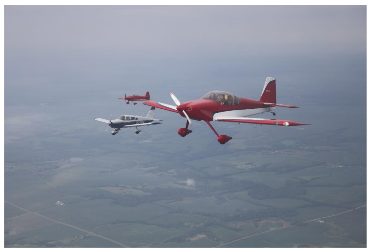
5. The RV-14, Cherokee, and RV-4 flying formation off the Cessna 150-150