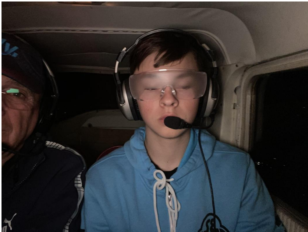
Tracking the Linden Vortac goggles on simulated instrument conditions on a spectacular night for flight with a \frac{3}{4} moon!