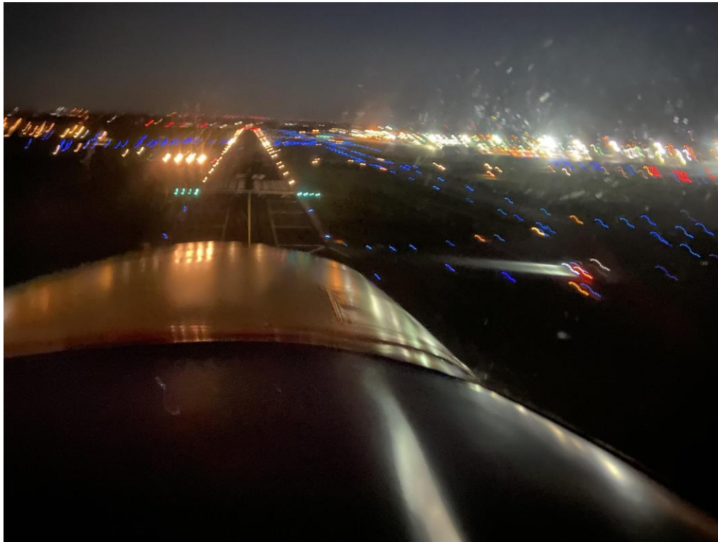
On short final to runway 20 Sacramento Executive Airport. He is appropriately high on the glide path and perfectly lined up. Looking good Dylan!