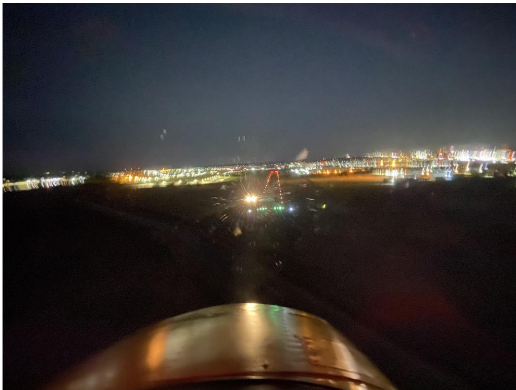
On the approach to the Nut Tree Airport runway 02. Lined up and appropriately high on the glide path.