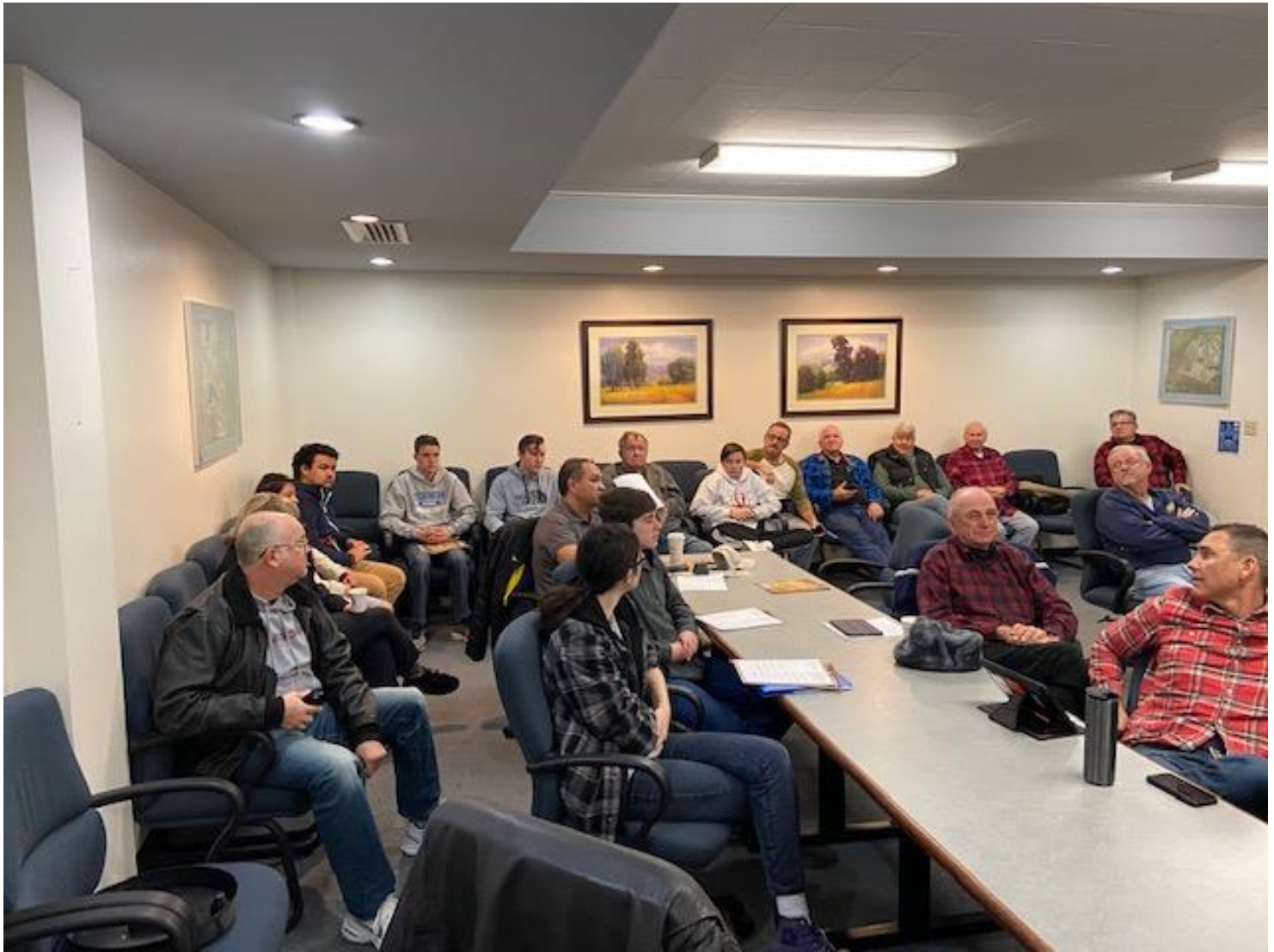
Remainder of the attendees (including our Young Eagles)