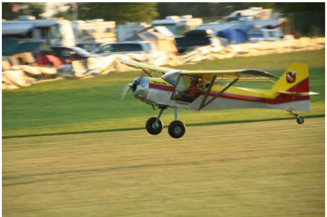
Larry Wenning getting some stick time at EAA's fun fly Zone 2017