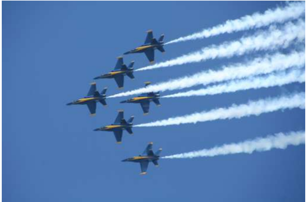
The Navy Blue Angels in a six ship formation paint the sky