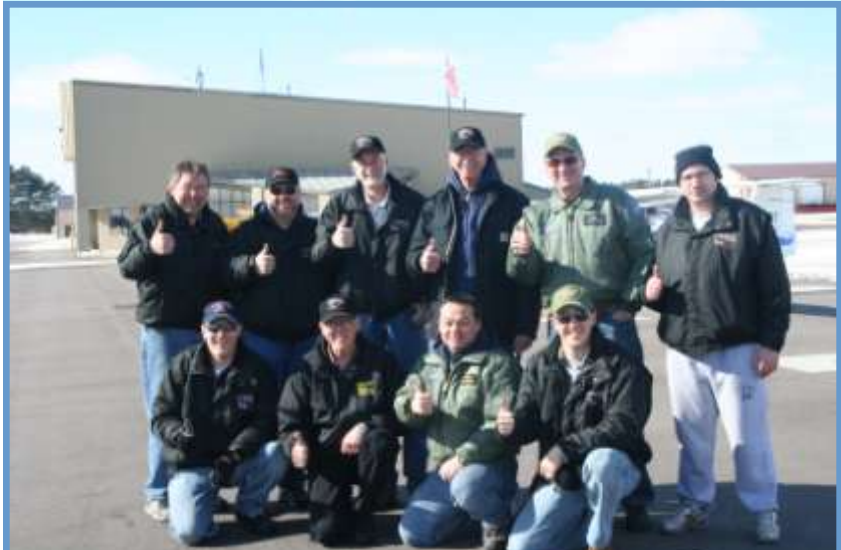
Bring the names of these pilots on a piece of paper to the Antigo Meeting for a chance to win the big door prize.