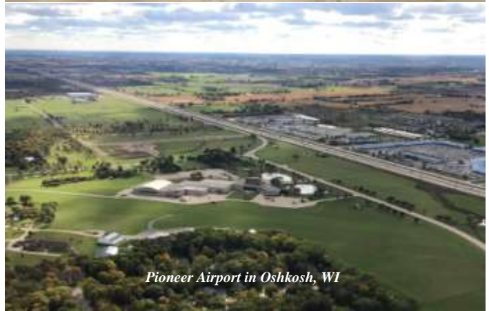
Pioneer Airport in Oshkosh, WI

ser, Paul Buss, and I flew to Pulaski Airport for a stamp and to call Austin Straubel International Airport. I called the Green Bay tower to get permission to land in Class C Airspace. We did not have transponders, but permission was granted and Green Bay was our next stamp. Clouds were on the lower side and we experienced some light spotty showers. After an hour delay waiting for the weather to improve, it was decided to head home. 2.9 hours on the Hobbs.