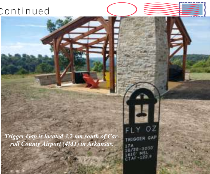
Trigger Gap is located 3.2 nm south of Carroll County Airport (4M1) in Arkansas.

Journey's End: The adventure couldn't end in Mineral Point with a lightening horizon on the course towards home. The quiet contemplation in the planes, once the limiting weather conditions were left behind us, was evident by the silent "pork chop" frequency. Our passing over the Baraboo Hills brought life back to the radio as the comparison of the Hills was made to those of the Ozarks. I am sure that we will carry reminders of this adventure with us forever.