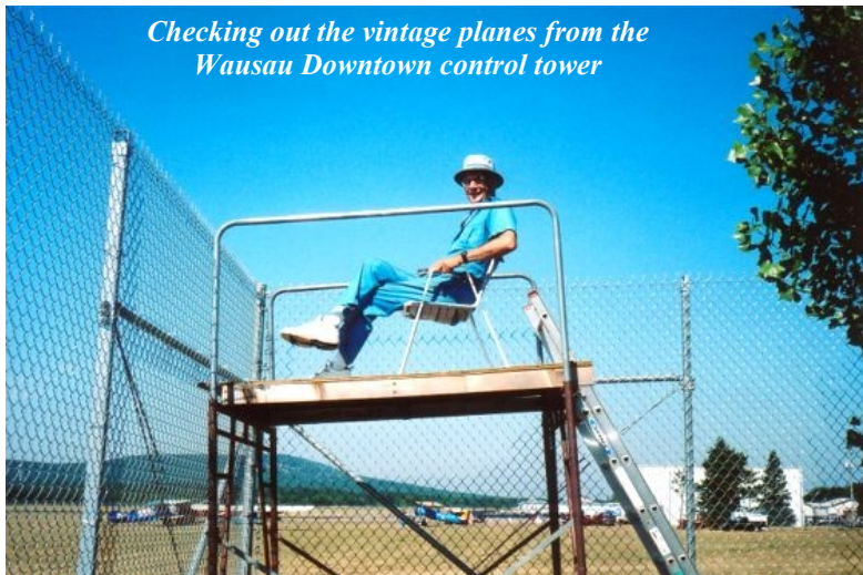
Checking out the vintage planes from the Wausau Downtown control tower