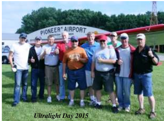
Ultralight Day 2015

Anyone who wants to have a fun afternoon learning about this fun and unique segment of flight can attend Ultralight Day. Vintage aircraft rides (not ultralights) are available for purchase, and lunch will be available