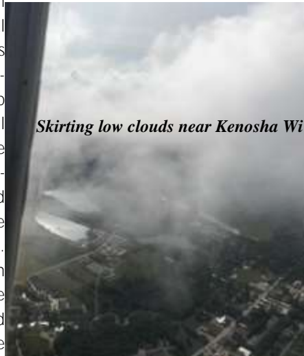
Skirting low clouds near Kenosha Wi

American Champion Aircraft Company. Next trip we will make time to do a factory tour!