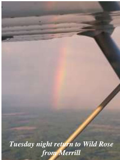
Tuesday night return to Wild Rose from Merrill

A keener eye than mine took notice that the hangar crowd was slowly migrating towards