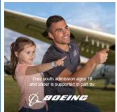
Free youth admission ages 18 and under is supported in part by

With support from The Boeing Company, youth ages 18 and under will be admitted free to EAA AirVenture Oshkosh 2021 as a way to introduce more youth to the possibilities in the world of flight.