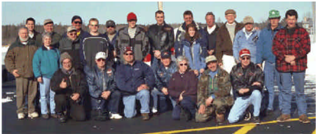
EAA Ultralight Chapter 75 Meeting - Tomahawk Airport - February 15, 2003