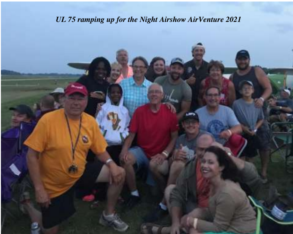
UL 75 ramping up for the Night Airshow AirVenture 2021