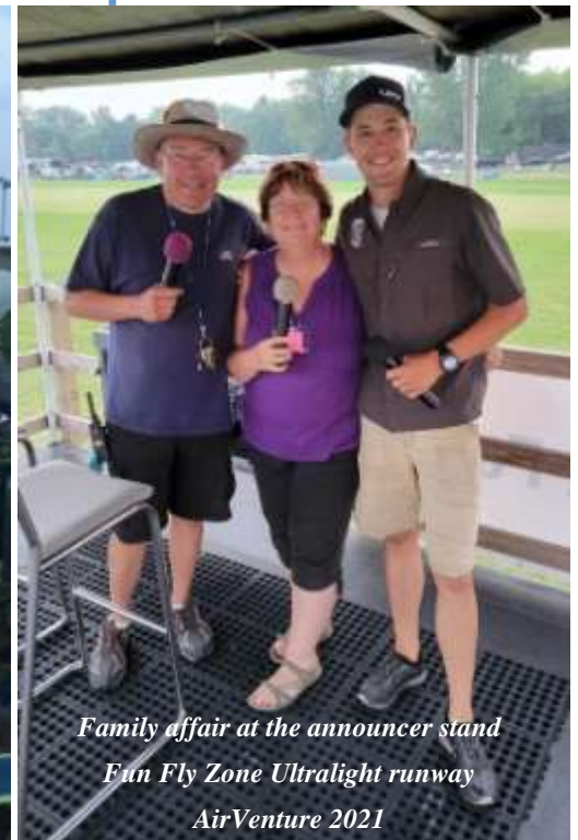
Family affair at the announcer stand Fun Fly Zone Ultralight runway AirVenture 2021