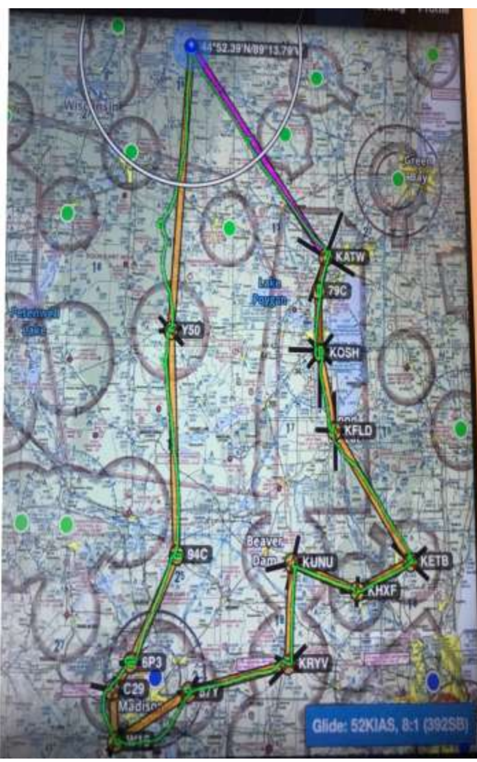
(Continued on page 4)