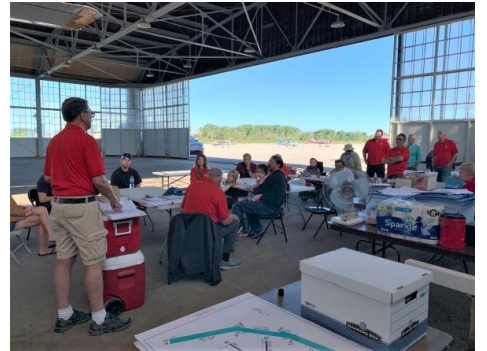
Opening Ceremony and Pilot Briefing