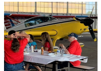
...and some other great acros (that are missing a set of wings)