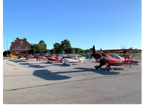
Contest Headquarter in the Dora Hangar