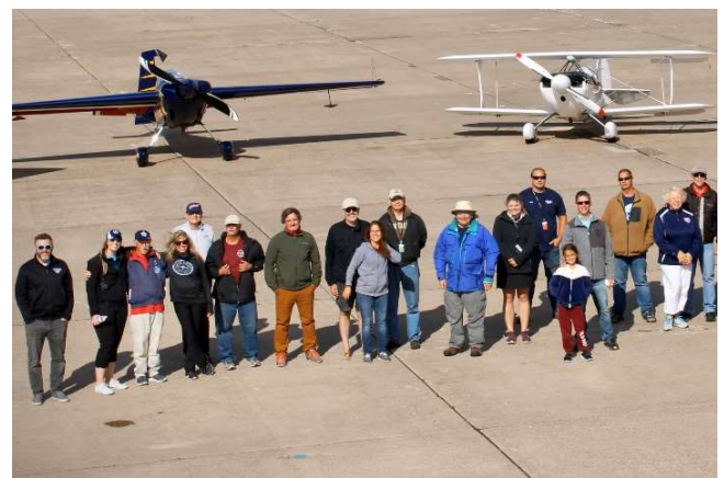
Group pictures (4)