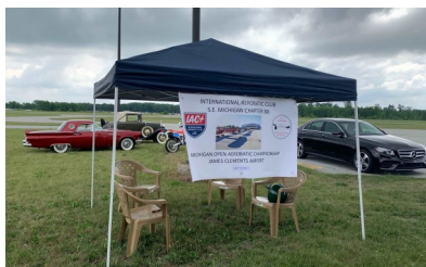
Low ceilings through mid afternoon