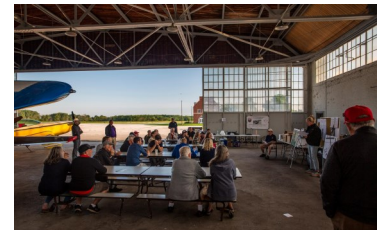
Pilot briefing 7:30 am Sunday: clear skies