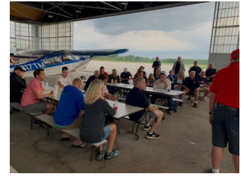
Pilot briefing 7:30 am Saturday: rain clouds approaching

A change in the weather forecast for the weekend was perhaps one of the main reason competitors hesitated making the trip to Michigan. With 11 competitors, this year's contest was one of the smaller in Chapter 88's 46 year contest history. Yet there was a good cross section of chapters and location these competitors flew in from: Florida, Georgia, Kentucky, New York, Minnesota, Ohio, Ontario Canada and Michigan. It turned out to be a 3 category contest with 5 Sportsman, 5 Intermediate and 1 Unlimited competitors. Although Friday was a perfect day for practicing in the box, Saturday morning turned into a hit and miss for competition flights. Late morning after few of the competitors had flown, all competition flights were put on hold due to persistent precipitation. Sunday morning we enjoyed a clear sky and excellent visibility to make it a two flights each contest.