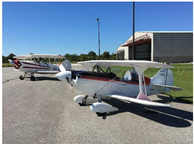
Great Lakes & Pitts S-1-E