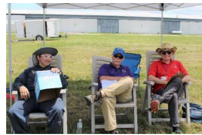
Line Judges with Assistants and Recorders