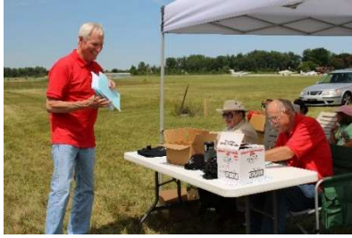
Chief Judge Table