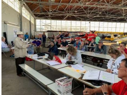
Saturday morning pilot briefing