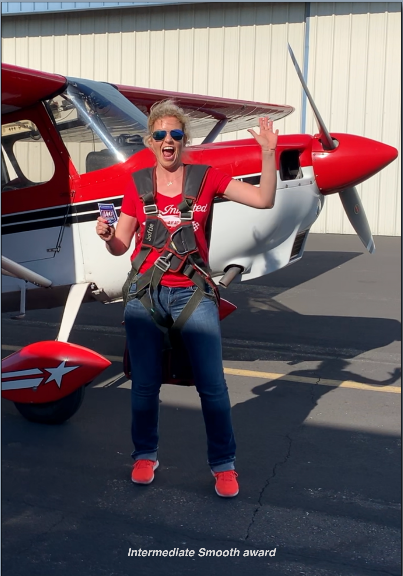
Intermediate Smooth award