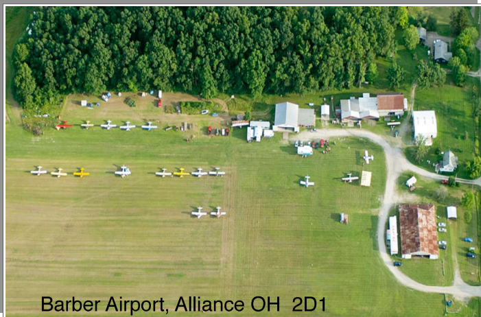
Barber Airport, Alliance OH 2D1