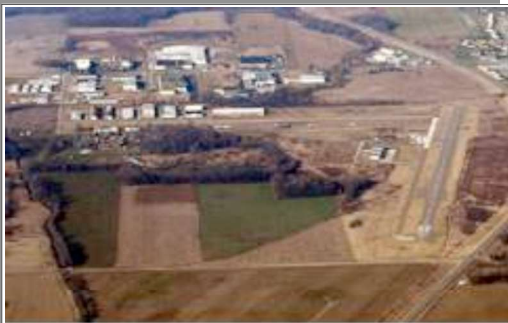
Wadsworth Municipal Airport 3G3