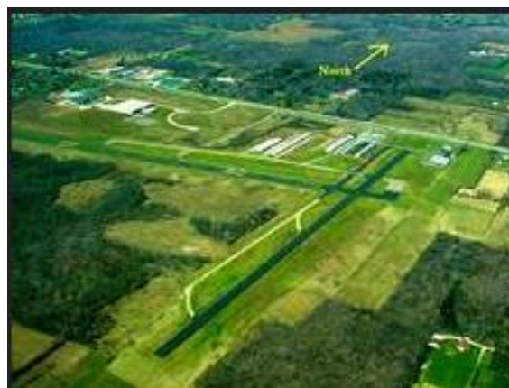
Medina Municipal Airport 1G5