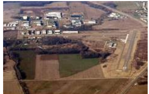
Wadsworth Municipal Airport 3G3

By July 1975 the chapter had planned and executed the first contest of their own in Medina, Ohio at the Freedom Field Airport. The contest was sponsored by the chapter and the Medina JCs. Sportsman through Unlimited categories were flown with a cash prize of $2000 to be split between the winners.