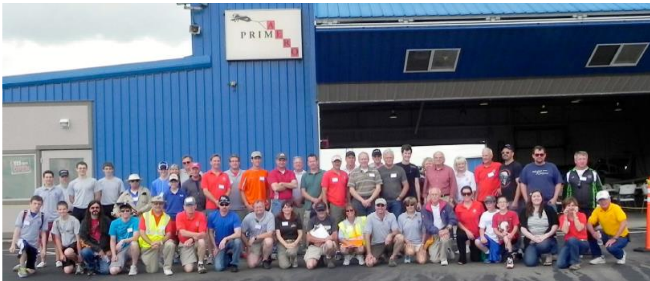
The Ohio Aerobatic Open was held for 8 years in Marysville, Ohio.

the contest there and associated aviation activity, the airport board of directors were not as enthusiastic. They limited practice and/or contest use of the airport to a total of six times a year and began asking for formal presentations annually to the board on the contest and chapter activities. Seeing the way the wind was blowing and feeling less than welcome, the chapter began looking around for a better situation.