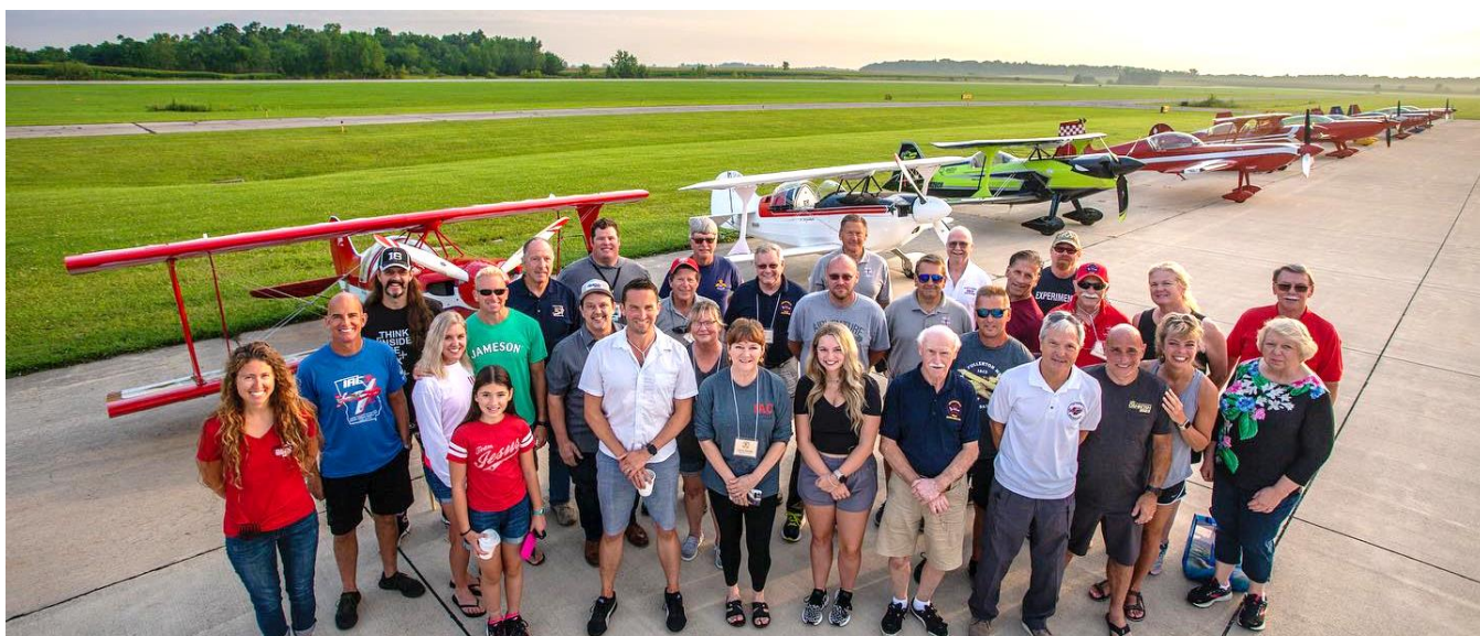
IAC Chapter 34 calls Bellefontaine, Ohio their home since 2014.