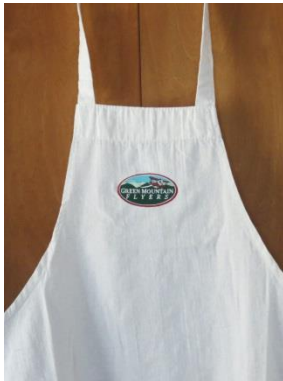
GMF logo (embroidered)