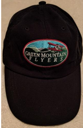
GMF logo (embroidered)