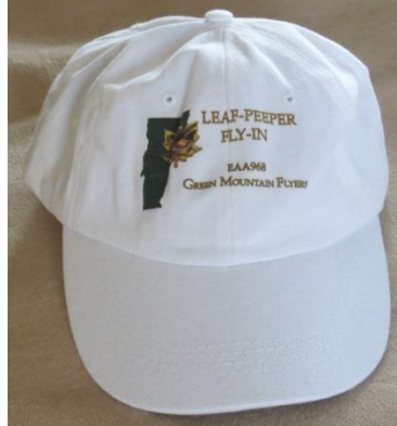
Leaf-Peeper (screen print)