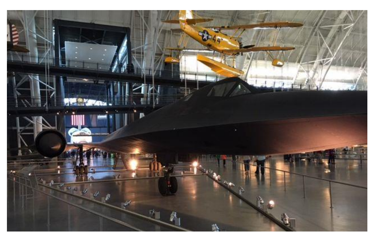
Here are Jim's shots of an SR-71 Blackbird and the Discovery space shuttle.