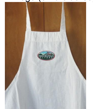
GMF logo (embroidered)