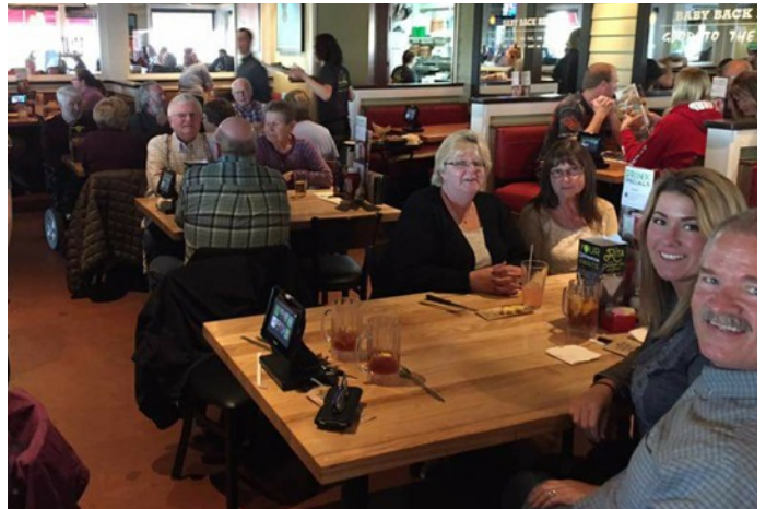
31 people came out to enjoy our Family Dinner Night at Chili's.